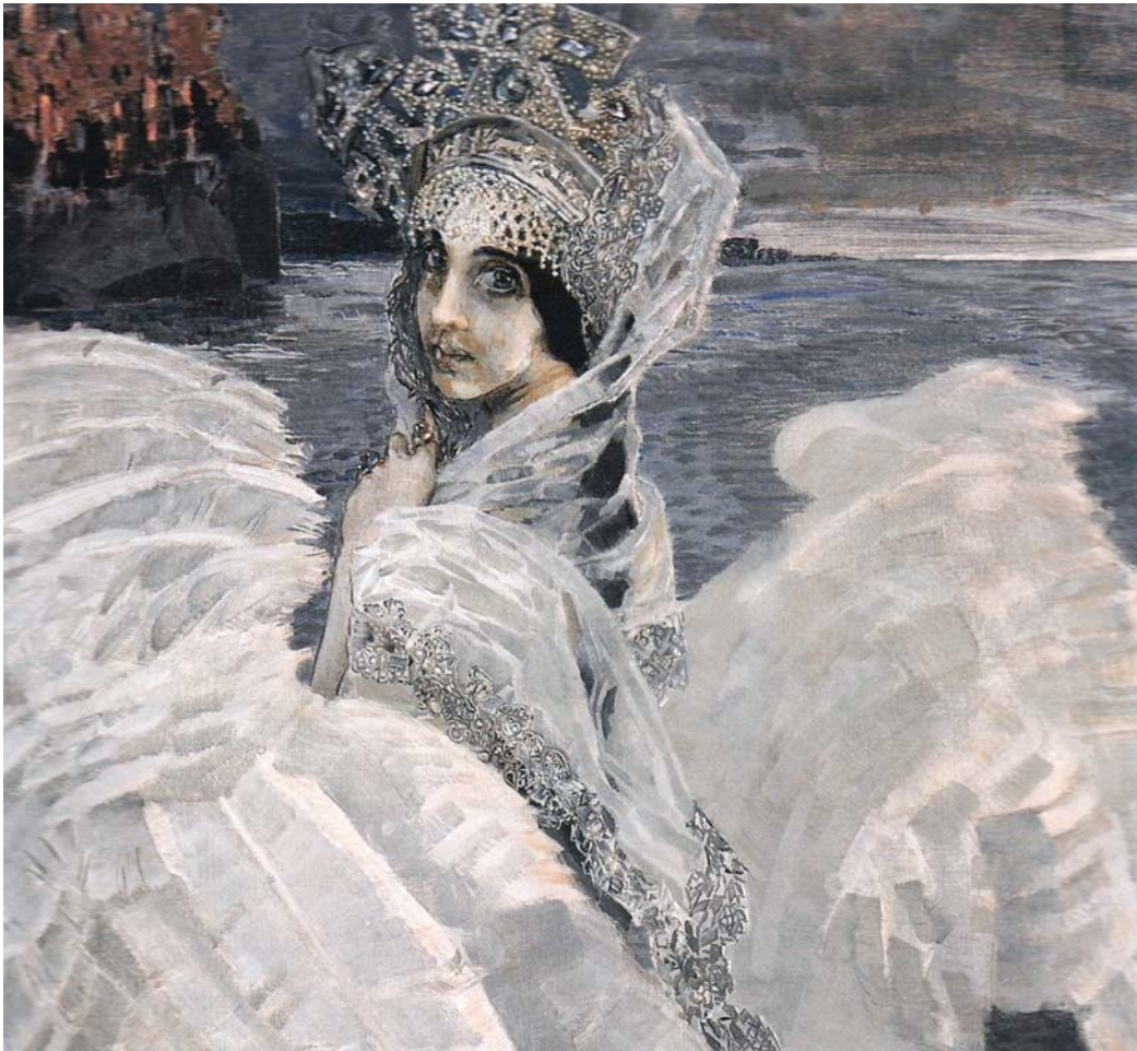
Mikhail Vrubel (1900); The Swan Princess ; Tretyakov Gallery, Moscow

Allerton Park & Retreat Center Monticello, Illinois, USA