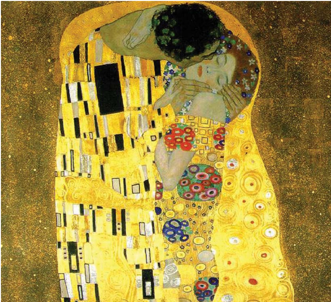
Gustav Klimt (1862–1918); The Kiss ; Österreichische Galerie, Vienna

Allerton Park & Retreat Center Monticello, Illinois, USA